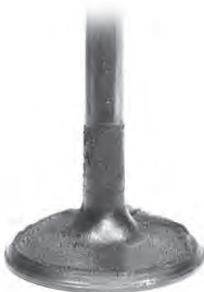
Intake Valve after P.i. Treatment