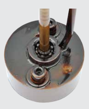
LEADING CONVENTIONAL HYDRAULIC FLUID (ISO 46)