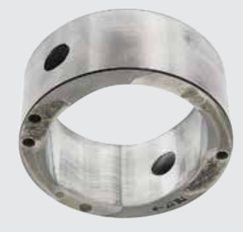
VANE PUMP CAM RING