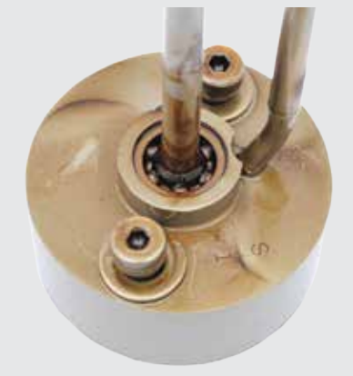
AMSOIL SYNTHETIC MULTI-VISCOSITY HYDRAULIC OIL (ISO 46)