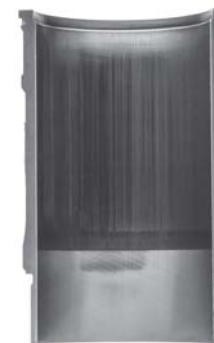
Severely Scuffed Liner