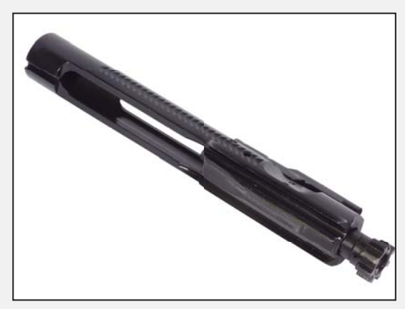
AMSOIL Synthetic Firearm Lubricant provided exceptional performance over rigorous range testing in multiple firearm applications.