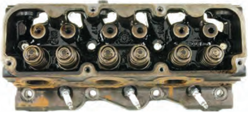
Cylinder head pre-cleanup. Note the sludge deposits on and around the valve springs and push rod openings.