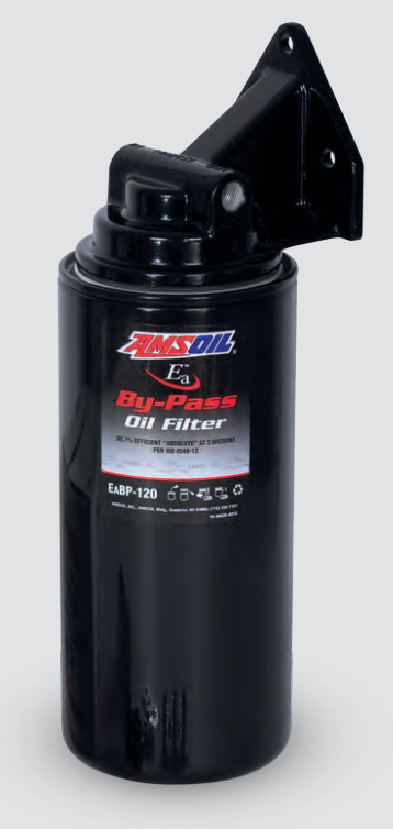
Fittings and hardware not shown

The Heavy-Duty Bypass Filtration System is constructed of high-quality cast aluminum with a steel filter spud that has been thoroughly tested in on-road and severe off-road service. The mount is finished with a thick layer of powder-coated paint to provide maximum resistance to the degrading effects of road salt, debris and engine-compartment chemicals.