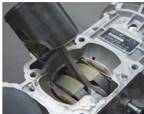
The pistons suffered only minor scuffing.